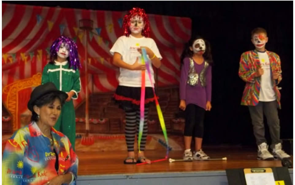
Judson ISD's Drama Kids program focuses on fostering imagination, improvisation, and presentation skills.

TCEA membership provides you and your district with a team of board members that will assist you with growing your programs. We are just a phone call or email away. Our board is here to serve you. We are a team that has experience and can share information. We can send members to your district to assist you. Attending the annual After School Workshop and Spring Conference provides you with invaluable networking opportunities, ideas to improve or add to your programs, introduce you to TCEA partners that can enhance your programs, etc. As a member of TCEA you can find information on the TCEA website. Community Educators are all one big family! We beg and borrow from each other. It is called survival. You can tap into that rich